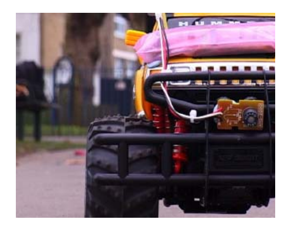
Figure 1. The prototype mobile sensor network node with carbon dioxide and air quality sensors.

We set out to investigate how toy robots can be augmented with environmental sensors and used to map pollution by grassroots communities. In the Feral Robots project (4) we have reconfigured low cost toy robots into vehicles of social and cultural activism, exploring how robotics could break out of the academic lab and how sophisticated equipment could be put into the hands of the general public by using the economies of scale of consumer manufacturers. In our current work we have designed and implemented a new generation of this technology and the software needed to enable it to sense pollution, add GPS location data and feed this back to the Urban Tapestries mapping platform.